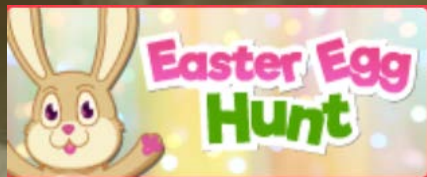
Find the Easter Eggs