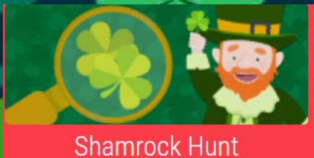
Find the Shamrocks