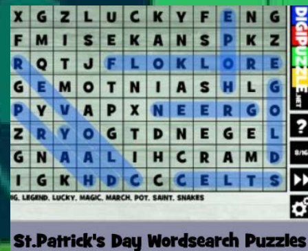
Word Search 1