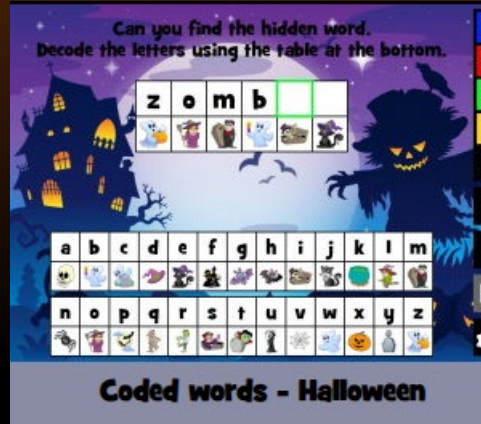
Coded words - Halloween