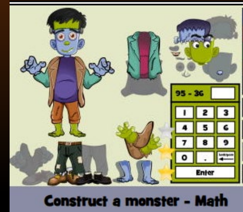
Construct a monster - Math