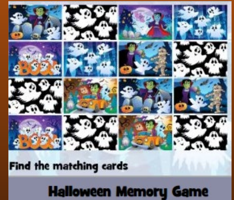
Halloween Memory Game